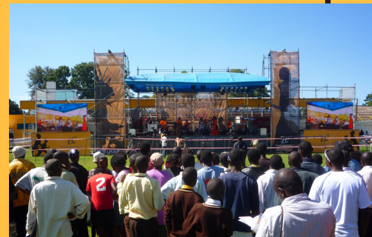
Rhythm of Life concert stage.