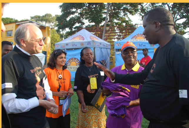
Ambassador and Deputy Minister of Health visiting New Start tent.

The Ambassador of the United States to Zambia, His Excellency Donald E. Booth and the Deputy Minister of Health, Honorable Mwendoi Akakandelwa, MP, were the guests of honor at Rhythm of Life. After touring the health booths and services on offer, they addressed the gathered crowd of thousands.