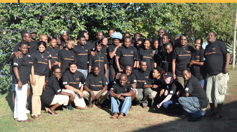
Siavonga workshop group.

In their workshop evaluation one participant said, "The workshop was an eye opener on health information and a great platform to have artistes unite for a common purpose." Another said, "This workshop is a very important tool to empower artistes and encourage them to be ambassadors carrying the health messages. I hope and trust that lives will be impacted out there through us spreading the message of what we have learned." In the words of another artiste, "I have learned much about health issues and I have learned even more about myself."