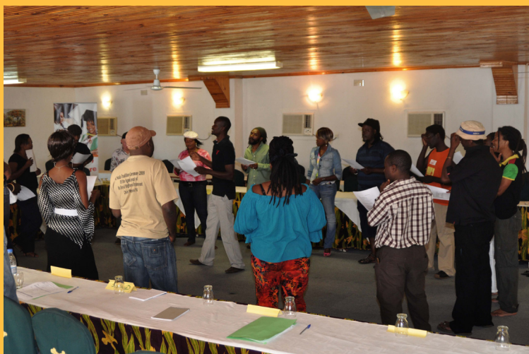
Rehearsing "Rhythm of Life" song.

Rhythm of Life included a health-themed art exhibit curated by renowned artist Mulenga Chafilwa that showcased the work of talented Zambian sculptors and visual artists. An all-day health-themed art competition for children was judged by a panel of prominent Zambian artists. The prizes for this competition were handed out by the guests of honor during the official part of the day. Prizes for a journalist competition organized by HCP, called "Health in the Headlines," were also given out after the art prizes. Immediately after the prize-giving ceremony, the festival's theme song, called Rhythm of Life, was performed by all the artistes, including Oliver Mtukudzi. Crowds clapped and danced along to the infectious beat and catchy lyrics that also had key messages about health seamlessly included in them.