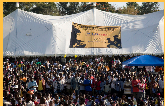
Partner health booths tent.

HCP Zambia is a five-year project, globally led by Johns Hopkins University Bloomberg School of Public Health – Center for Communication Programs in partnership with Save the Children (US) and International HIV/AIDS Alliance. This program is funded by the United States Government, through the U.S. President's Emergency Plan for AIDS Relief (PEPFAR), the U.S. President's Malaria Initiative, and through United States Agency for International Development health funds.