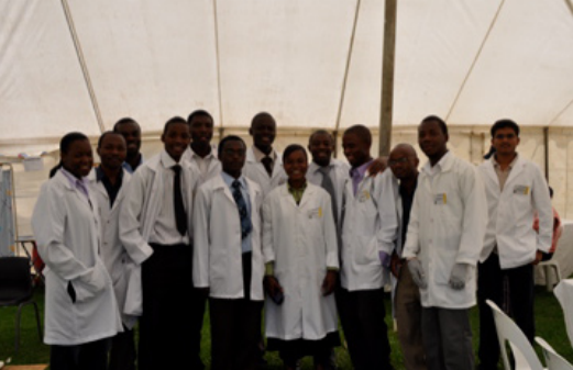
UNZA medical students.