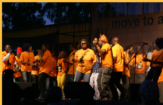
Live performance of "Rhythm of Life" song.

Satellite activities centering around the live broadcast took place around the country. Some of these were initiated by HCP offices in 22 hard-to-reach districts. In Mansa, for example, the HCP District Program Officer, Francisca Tembo, worked closely with district partners to organize a local health fair on the same day as the Lusaka concert. The fair featured local drama groups and other entertainment, culminating in a joint viewing (by a crowd of over 1,000 people) of the two-hour live television broadcast using mobile video screens installed for this occasion in the local football stadium by the Zambia News and Information Services.