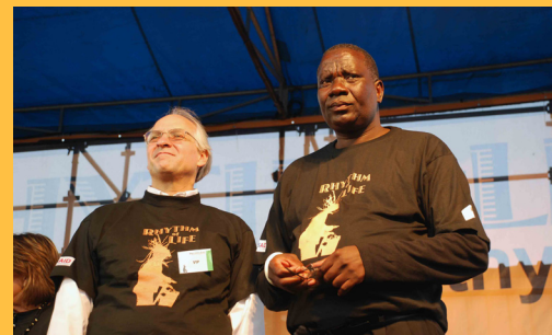
The Ambassador and the Deputy Minister of Health on stage.

“More than a quarter of women 15-19 are either mothers or currently pregnant according to the Zambia Demographic and Health Survey of 2007,” said the Deputy Minister of Health. “There is a need to make family planning information and services available to anyone who seeks it, particularly ensuring we have caring and supportive health care providers as well as uninterrupted supply of contraceptive methods even in the most rural areas.”