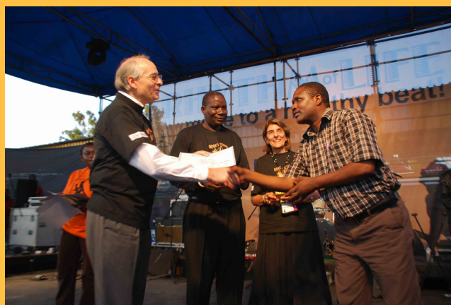
Journalism contest winner.